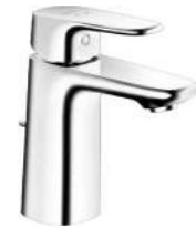
Basin Mixer with Pop-Up Drain FFAS1701-1015LOBCO