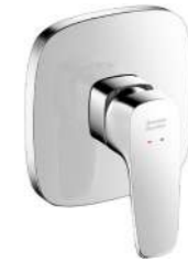
Concealed Shower Mixer FFAS1722-709500BCO