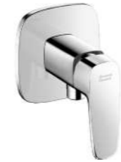
Exposed Shower Mono FFAS1726-701500BTO