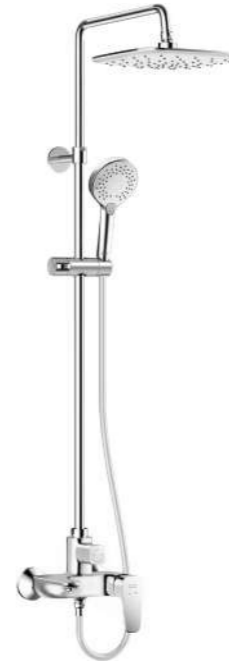
Exposed Bath & Shower Mixer with Rainshower Kit