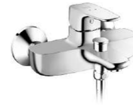
Exposed Bath & Shower Mixer FFAS1711-609500BCO