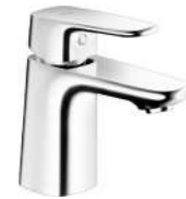
Basin Mono FFAS1706-1015LOBTO