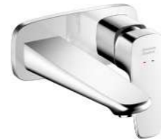
Wall Mount Basin Mixer with Pop-Up Drain FFAS1704-1015LOBCO