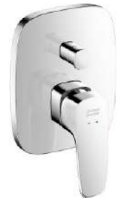
Concealed Bath & Shower Mixer FFAS1721-609500BCO