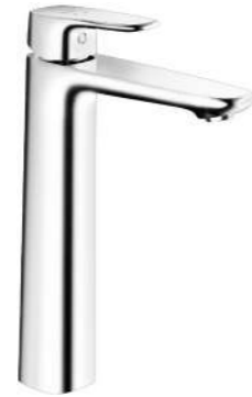
Extended Basin Mixer with Pop-Up Drain FFAS1702-1015LOBCO