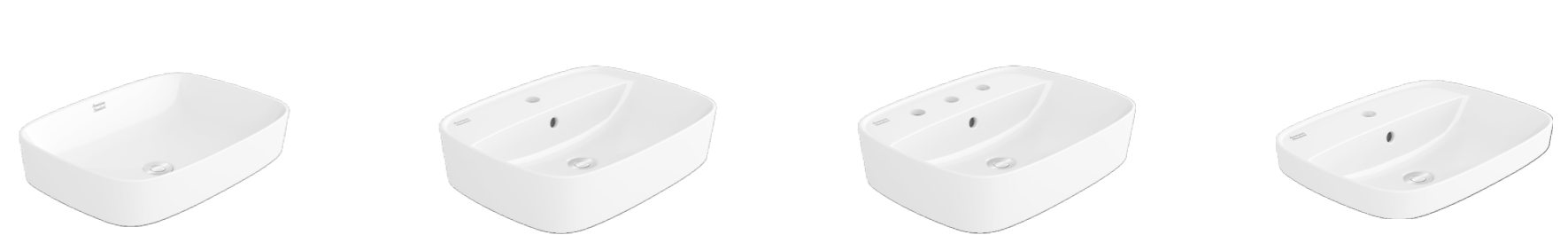
Vessel L400 x W550 x H100mm CCAS0628-0000410FO