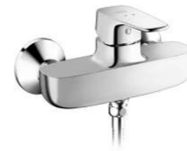
Exposed Shower Mixer FFAS1712-709500BCO