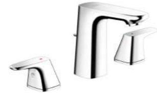
3-Hole Basin Mixer with Pop-Up Drain FFAS1703-1015LOBCO