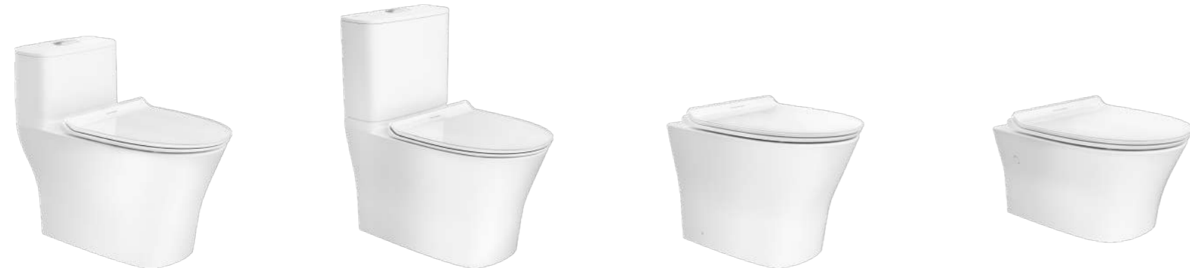
One Piece Toilet L730 x W382 x H650mm CCAS1880-111A410FO (Toilet) CCASC119-U20U420CO (Seat Cover)