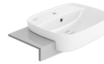
Semi-Counter Basin L430 x W550 x H125mm CCAS0320-1010410FO