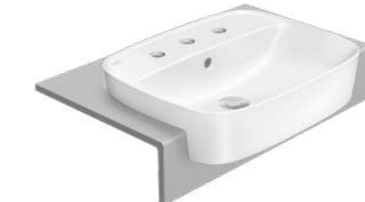
Semi-Counter Basin (8 inch hole) L430 x W550 x H125mm CCAS0320-1080410FO