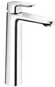
Extended Basin Mono FFAS1707-1015LOBTO