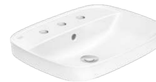
Counter Top Basin (8 inch hole) L430 x W550 x H50mm CCAS0420-1080410FO